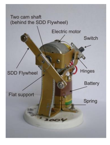
Fig. 3. The First Spatial Inertial Machine capable of one way transfer and conversion of quantities and qualities between fixed to the vehicle axes irreversibly and permanently, 2004.

The Newtonian Mechanics is not capable to recover the quantities and qualities in X and Y at the right side of (1) using the ones from the left side, because it doesn't possess spatial properties (properties to transfer quantities and qualities from one to other degree of freedom). The Gyroscope is capable to transfer and convert the quantities and qualities from one to other degree of freedom i.e. from the right to the left side of the equation (1). But the Gyroscope fails to recover reversibly the quantities and qualities at the right side of the same equation (1) using the ones from the left side, because, as is seems, it possesses one way spatial properties. It looks that the only way to recover the quantities and qualities at the right side of (1) using the ones from the left side is to apply the gyroscope again, but somehow oppositely. Detailed analysis (not provided here) points that even if we apply the gyroscopic phenomenon differently by all possible ways, and as many times as we wish, we can't recover the initial inertial state in full scale.