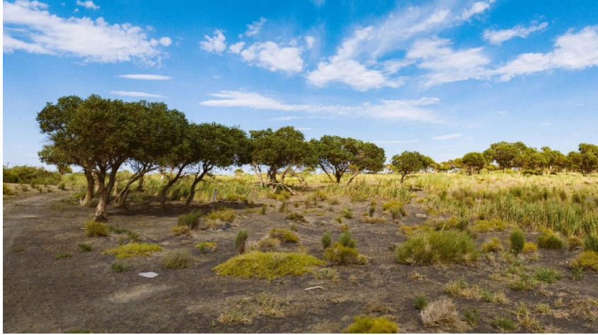
Figure 1: a picture.

water today. Is it composed of molecules or atoms? Is the object itself colored, or is it the light it reflects? The nature of the cup can vary under different conditions and in different environments. Precise descriptions depend on the specific environmental conditions.