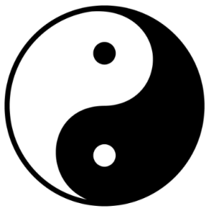
Figure 3: The non-local grid dimensions and the quantized local space-time behave like Yin and Yang.

The non-local grid dimensions and the local quantized space dimensions Are like the Chinese Yin and Yang (figure 3) where the grid dimension enables the non-locality of quantum mechanics (entanglement) and the non-locality of The Einstein's unique field equation solution of wormholes (ER=EPR). This model enables to visualize these non-local connections in a symmetrical, three-dimensional space.