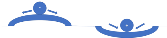
FIG. 1: Positive and negative matter bend the fabric of space-time.

There is a positive and negative charge in the electric force, so why is there no positive and negative mass in the gravitational force in our universe? The absence of negative mass prompted us to propose a new model on how negative masses bend the fabric of space-time.