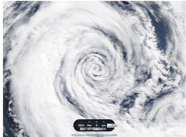
Figure 1: The extratropical cyclone at the height of the Falklands had a minimum central pressure of 970 hPa (mbar) on Wednesday morning, so it is an intense and deep system. It is not an unusual event, since around Antarctica there is a so-called belt of low pressure and more intense cyclones are common in places further south of the Atlantic UOL, 2022; Lindblad, 1964. Image in Zoom Earth Earth, 2022.

An "explosive EC" is an atmospheric phenomenon that occurs when there is a very rapid drop in central atmospheric pressure. This phenomenon, with its characteristic of rapidly lowering the pressure in its interior, generates very intense winds and for this reason it is called explosive cyclone. Edwards, 2006; Bluestein, 2013, Gobato, Gobato, and Heidari, 2018; Gobato, Gobato, and Heidari, 2019a, Gobato, Gobato, and Heidari, 2019b It was determined the mathematical equation of the shape of the extratropical