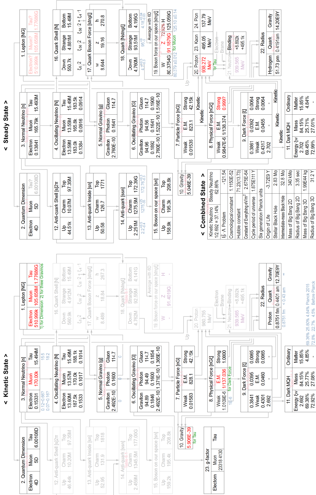
Fig. 1 Calculation of everything by Q-theory