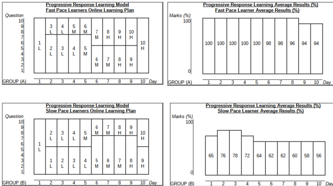
Figure 3. The results from applying Progressive Response Learning approach on two different groups of learners, GROUP (A) – Fast Pace Learners group and GROUP (B) – Slow Pace Learners group.

All learners (fast and slow pace learners) are required to do all 10 Q&A sections, each section a day, within 10 days. In this model, we will repeat some of the previous Q&A in every exercise and using this approach we can encourage the learner to retrieve the skills the learner learned from the previous exercise and increase the confidence level when facing new questions. The outcomes from this assessment are represented in marks (in %) and the Difficulty level are presented on the charts (Figure 3).