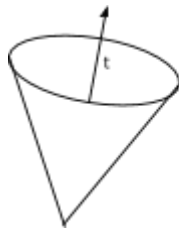
Figure 2: My 4-dimensional world (post-relativity) (identity self-map on the surface of the cone)

Figure 1 depicts 18 how pre-relativistic physics (and each of us day to day, avocationally) assumes we can nominatively label our 4-dimensional world: into distinct regions of up/down-like-increment , left/right-like-increment , forward/backward-like-increment and past/future-like-increment : the labelling is nominative , because we can choose completely different labels without any real phenomenological consequence - our labelling is purely conventional.