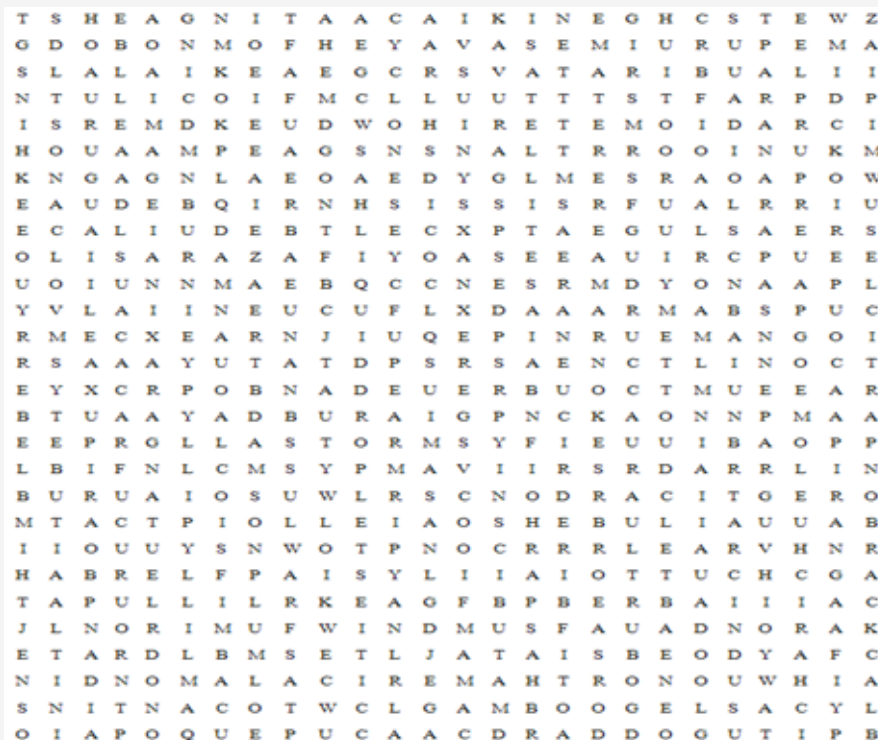
Figure 2: Main diagrams containing all the words to be found, in situations from (I) to (III).

drifted over NORTH AMERICA and AFRICA, three different tropical CYCLONES churned in the PACIFIC OCEAN, and large clouds of dust blew over deserts in Africa and Asia. The STORMS are visible within giant swirls of SEA SALT AEROSOL (blue), which winds loft into the air as part of sea spray. BLACK CARBON PARTICLES (red) are among the particles emitted by fires; vehicle and factory emissions are another common source. Particles the model classified as dust are shown in purple. The visualization includes a layer of night light data collected by the day-night band of the VISIBLE INFRARED Imaging RADIOMETER Suite (VIIRS) on SUOMI NPP that shows the locations of TOWNS and CITIES (Figure 2).