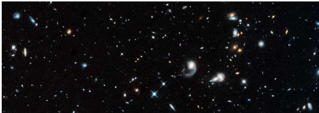
Figure 1 Various galaxies in the universe photographed by the Hubble Telescope

Therefore, in a comprehensive view, the Galactic Center is more likely to be a white hole.