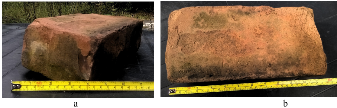
Fig. 1. Non-contact measurement of brick.

In reality there are many possibilities that what we see or measure is just an illusion. Above all it applies to non-contact distant measurements which are used in the SRT. For example, the result of brick length measurement depends on the angle between the brick surface and tape measure (Fig. 1).