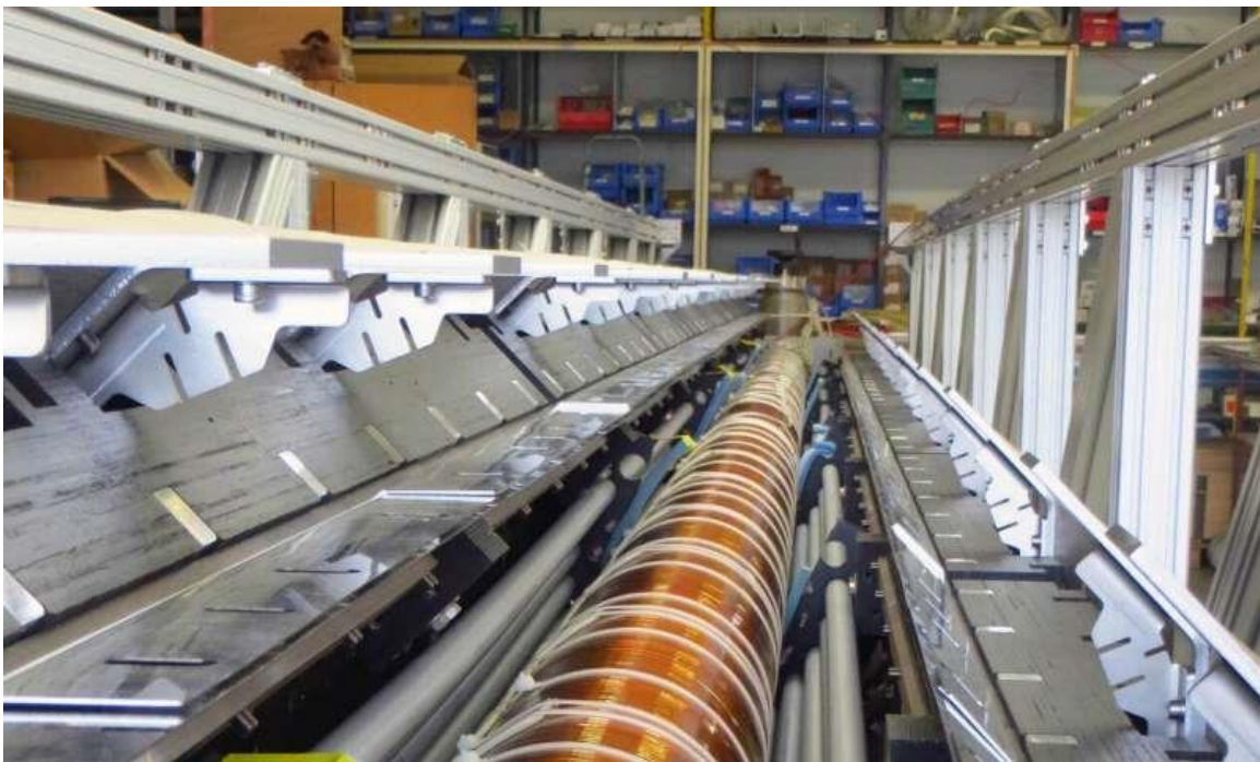
The vacuum chamber for the atomic fountain with magnetic shield.

For the publication in Science Advances , the authors assumed a quantum-mechanical variant of the twin paradox with only one twin. Thanks to the superposition principle of quantum mechanics , this twin can move along two paths at the same time. In the researchers' thought experiment , the twin is represented by an atomic clock . "Such clocks use the quantum properties of atoms to measure time with high precision. The atomic clock itself is therefore a quantum-mechanical object and can move through space-time on two paths simultaneously due to the superposition principle. Together with colleagues from Hannover, we have investigated how this situation can be realised in an experiment," explains Dr. Enno Giese, research assistant at the Institute of Quantum Physics in Ulm. To this end, the researchers have developed an experimental setup for this scenario on the basis of a quantum-physical model.