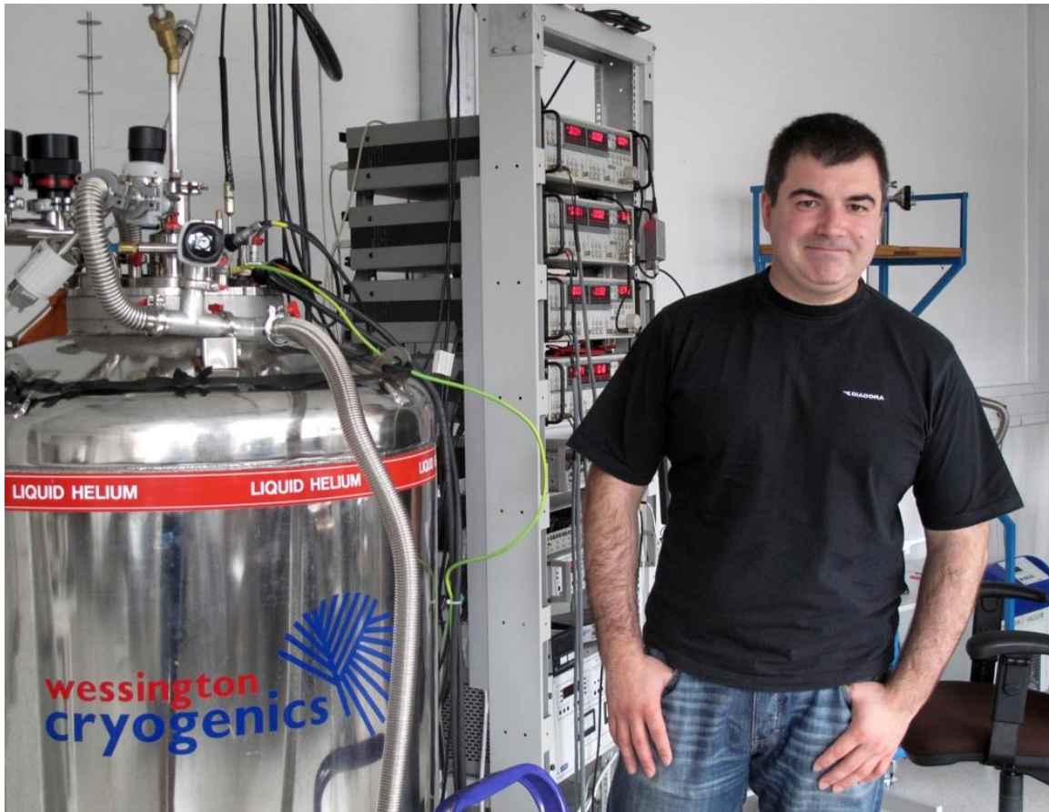
A 3D view on 2D materials

The technique employed in this study, which is reported in Physical Review Letters , might be used on other unsupported 2D materials in solution, he adds.