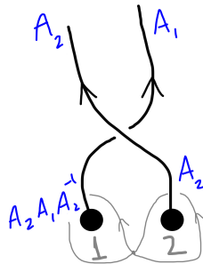
Figure 3: Dirac strings crossing for two test charges

Quandle objects A_1 and A_2 can represent the braiding of flux lines (Dirac strings) in the Aharonov Bohm effect [18], as indicated in figure 3. We think of our electric ribbon charges concretely as the motion of the charges around flux lines, so that categorical axioms literally represent the physics. Our cosmological dyons are associated to a mirror pair of states at an abstract topological surface [13], and we represent them categorically starting with the Hopf symmetry breaking mechanism of [16].