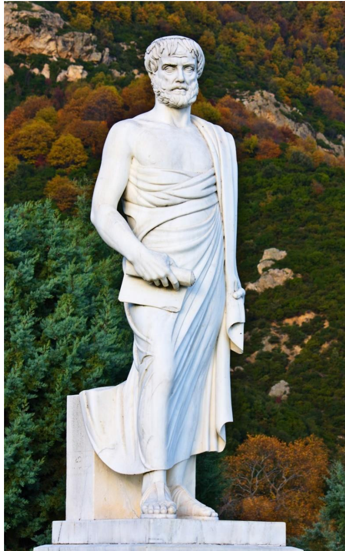
Fig. 1. Statue of Aristotle in Stagira, Greece.

Throughout our careers we are taught to conform to the status quo , i.e. to the opinions and behaviors of others. Organizations and their workers both pay a price: decreased engagement, productivity and innovation. According to Gino (2016), if you want engaged employees, you should encourage them to question the status quo and bring out their signature strengths.