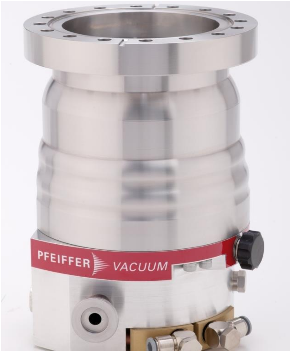
The HiPace turbomolecular pump from Pfeiffer Vacuum

Meanwhile, the effect of ionizing radiation on materials can demand a whole new approach to pump design. Most large-scale experimental facilities exploit high-speed turbopumps to maintain UHV conditions, but to be effective they need a backing pump to reduce atmospheric pressure to a “rough” vacuum. In the case of J-PARC, the project team were concerned that the Teflon used within the two most common types of backing pump – oil-sealed or dry backing pumps – would become more brittle when exposed to radiation.