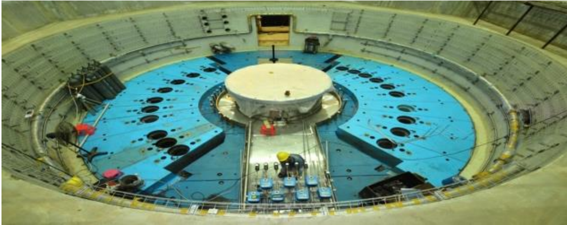
The tungsten target at the China Neutron Spallation Source

But radiation is still a major concern for these high-power neutron sources. At the Japanese Proton Accelerator Research Complex (J-PARC) – the most intense neutron source in operation today – radiation levels can reach millions of grays in the vicinity of the neutron beam.