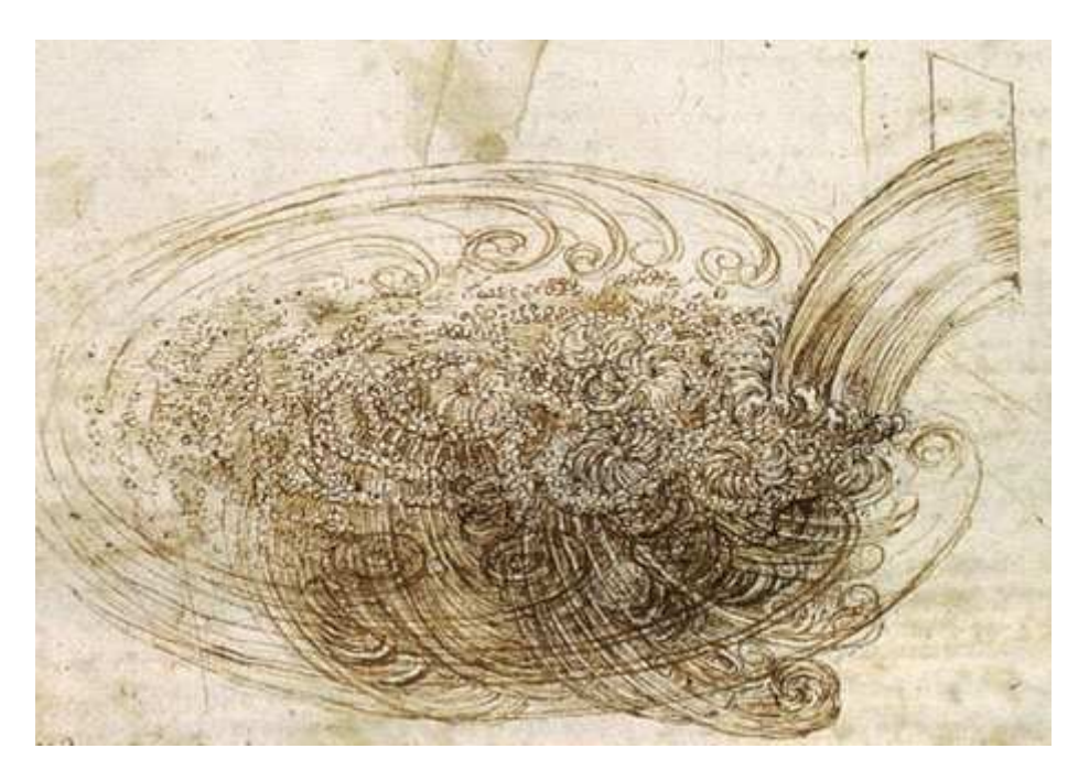
Figure 3.1.: Turbulences understood by Leonardo da Vinci

3. Definition of a moved fluid-continuum