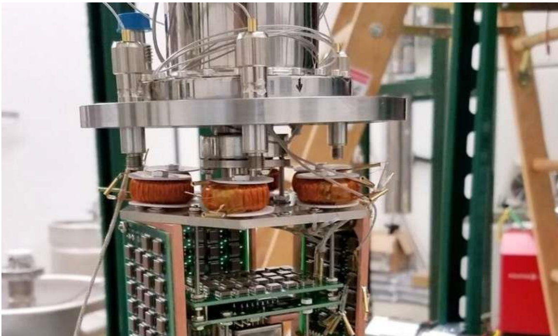
A low-mass dark matter experiment is set up at UC Berkeley.