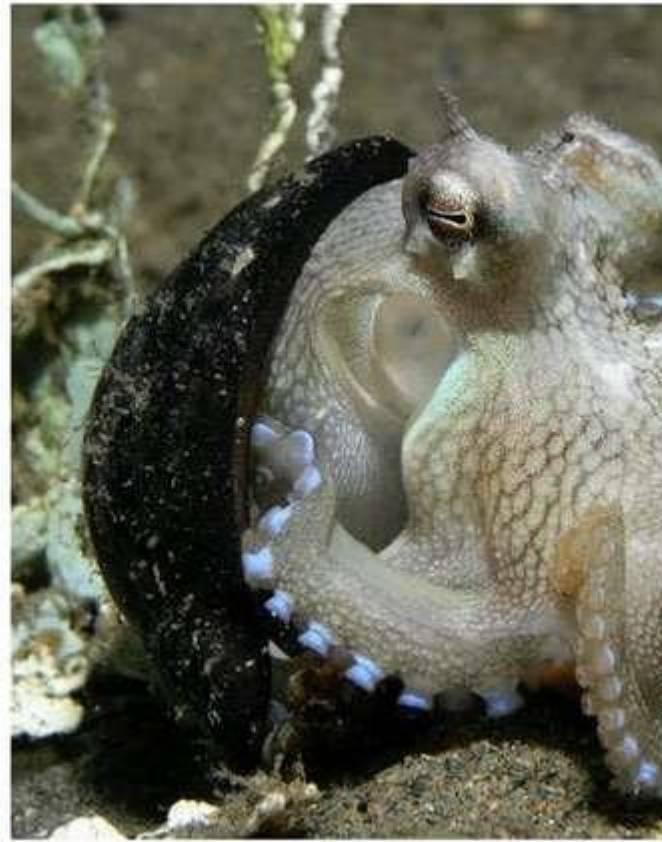
A capuchin ( Sapajus libidinosus) using a stone tool. An octopus ( Amphioctopus marginatus) carrying shells as shelter.

For example, the SETI Institute's Allen Telescope Array is named after Microsoft co-founder Paul Allen, who contributed over US$25 million to the project. And, in 2015, technology investor Yuri Milner announced Breakthrough Listen , a 10-year US$100 million SETI initiative.