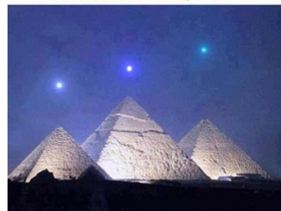
PLANETARY ALIGNMENT WITH THE GIZA PYRAMIDS, IT ONLY HAPPENS ONCE IN 2,737 YEARS

In this introduction I'll refer just to some interests we got by the 2737 Egyptian phenomenon.