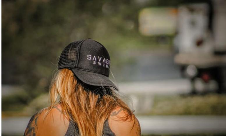
Figure 6: Deviant 3