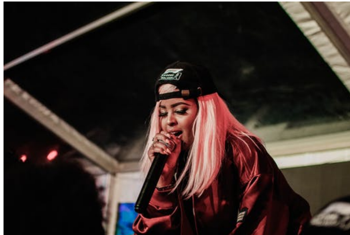
Figure 4: Deviant

Now, after everyone wore their caps in the default orientation, deviants began to wear their caps backwards instead [4].