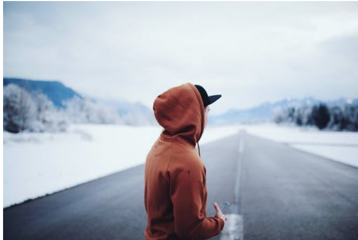
Figure 1: A Cap

Ever since caps were worn, fashion deemed it necessary that everyone eventually migrate to new styles as the older styles became "worn" and "uncool." Unfortunately, as of yet, there have been no mathematical explanations for how these new styles have come about. We henceforth set about creating a mathematical foundation for the styles people use for wearing their hats, caps, and other headpieces of choice.