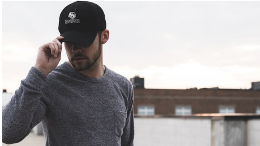
Figure 7: Transcendent Deviant