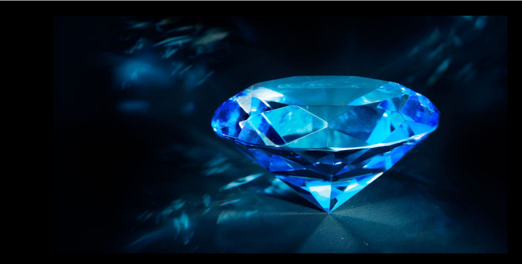
Y_{d} = 10^{12} \ \text{N/m}^{2} Young's elastic modulus for diamonds