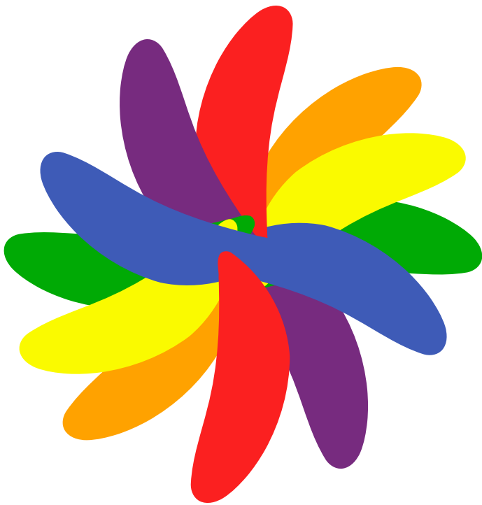
Fig 1. A gay wormhole