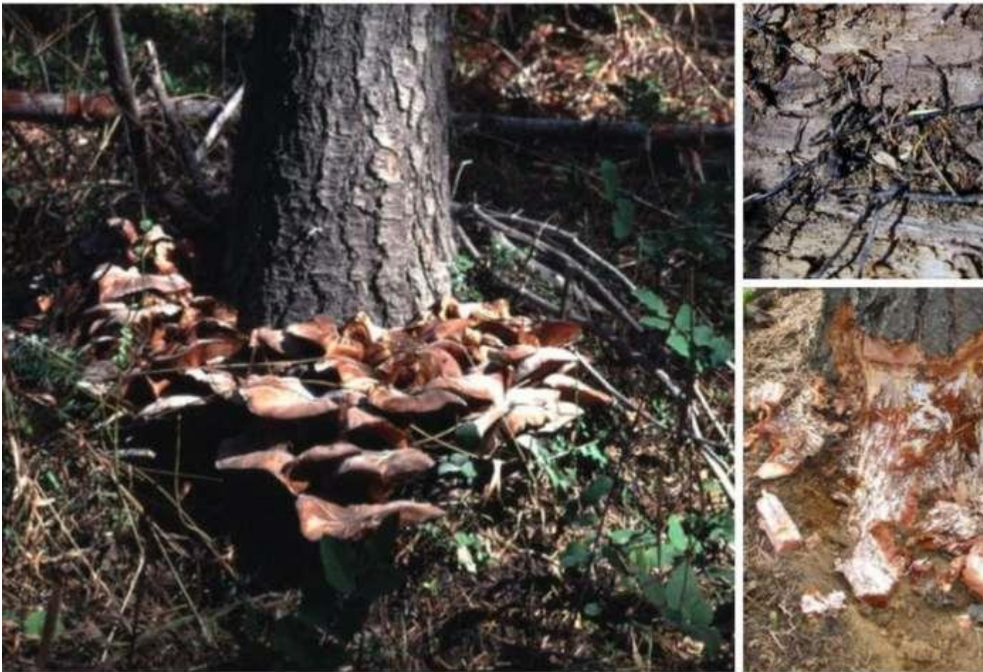
Parts of the Armillaria ostoyae organism include the mushrooms, the black rhizomorphs and the white mycelial felts.

In a keynote at this year's Breakthrough Discuss conference, astrophysicist Martin Rees shared a similar hope, that AI could lead to "intelligence which surpasses humans as much as we intellectually surpass slime mould."