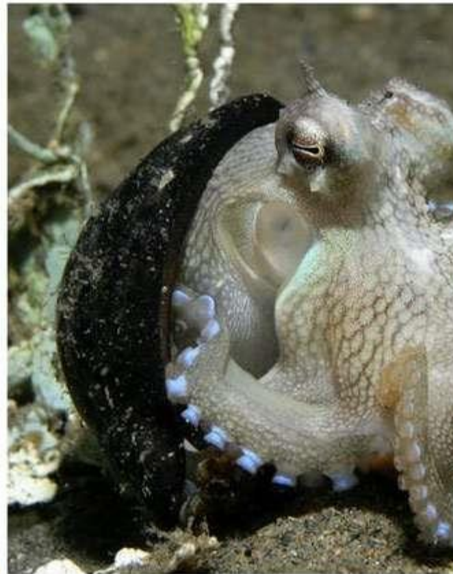
A capuchin ( Sapajus libidinosus ) using a stone tool. An octopus ( Amphioctopus marginatus ) carrying shells as shelter.