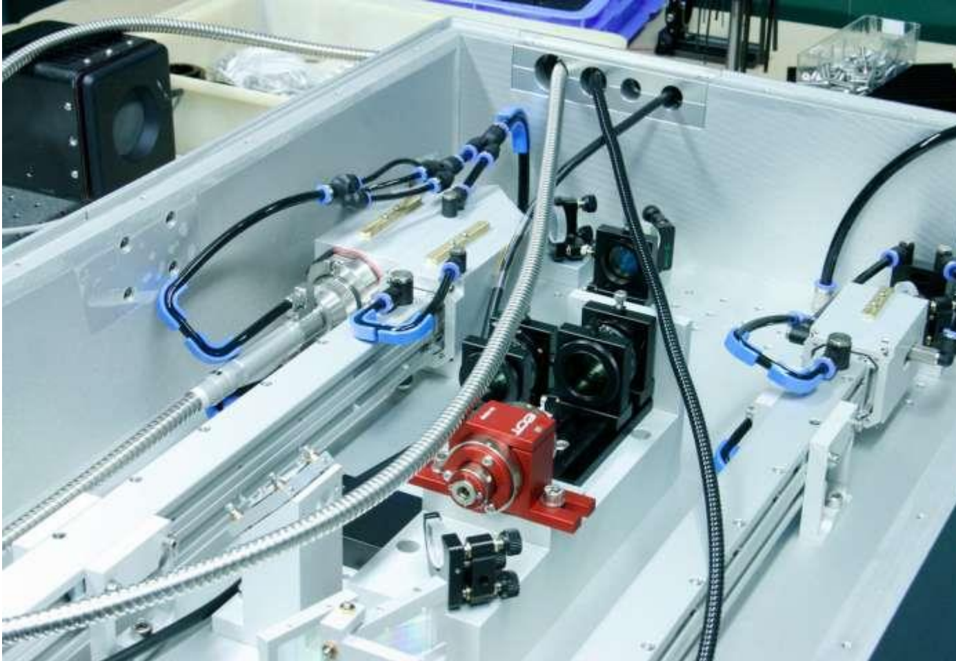
Main amplifier stages of the fiber laser system, where high pulse energies are generated.

The spectrometer consists of three main components: an ultrafast laser system, an enhancement resonator and a sample chamber with the actual spectrometer itself. As the initial laser, the researchers use a phase-stable titanium-sapphire laser. They change its laser beam in the first component: by means of pre-amplifiers and amplifiers, they ramp up the power from 300 microwatts to 110 watts – a millionfold increase. In addition, they shorten the pulses. To do this, they use a trick whereby the laser beam is shot umpteen times through a solid, which widens the spectrum. If you then put these newly created frequency components of the pulse back together again – that is, if you combine all frequencies in a phase-correct manner – you shorten the pulse duration. "Although this method was already known beforehand, it was not possible until now to compress the pulse energy that we need here," says Dr. Peter Rußbüldt, group manager at Fraunhofer ILT.