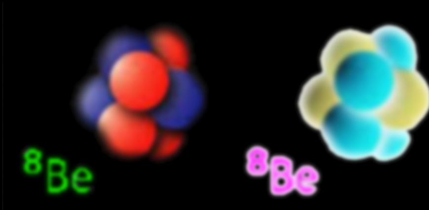
representations of {}^8\text{Be} and anti- {}^8\text{Be}

Matter expands/dilates time; antimatter compresses / quickens.