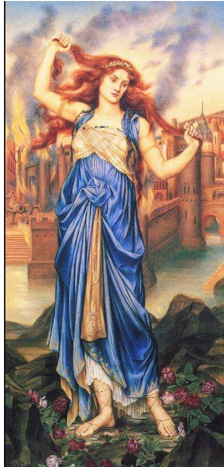
Evelyn De Morgan painting of Cassandra

The Cassandra (Ratio) term originates in Greek mythology. Cassandra was a daughter of Priam, the King of Troy. Struck by her beauty, Apollo provided her with the gift of prophecy, but when Cassandra refused Apollo's romantic advances, he placed a curse ensuring that nobody would believe her warnings. Cassandra was left with the knowledge of future events, but could neither alter these events nor convince others of the validity of her predictions.