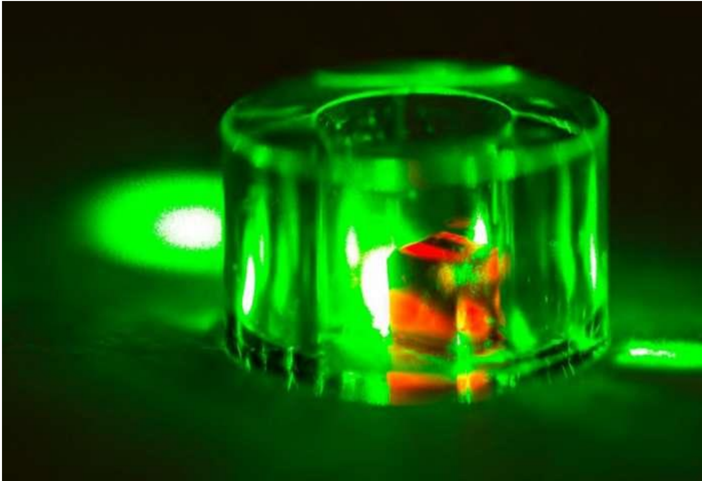
The diamond is held inside a sapphire ring and illuminated by 532-nm green laser. The red light is fluorescence from the NV centres.

Carbon atoms were 'knocked out' from the diamond using a high energy electron beam, creating spaces known as 'vacancies'. The diamond was then heated, which allowed nitrogen atoms and carbon vacancies to pair up, forming a type of defect known as a nitrogen-vacancy (NV) defect centre. The diamond was provided by Element Six.