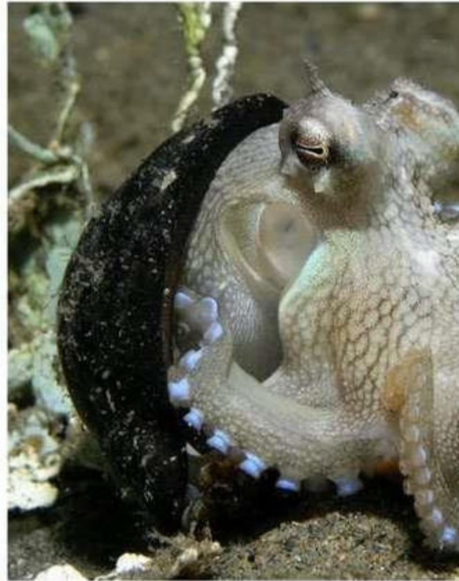
A capuchin ( Sapajus libidinosus) using a stone tool. An octopus ( Amphioctopus marginatus) carrying shells as shelter.

For example, the SETI Institute's Allen Telescope Array is named after Microsoft co-founder Paul Allen, who contributed over US$25 million to the project. And, in 2015, technology investor Yuri Milner announced Breakthrough Listen , a 10-year US$100 million SETI initiative.