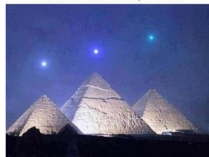
PLANETARY ALIGNMENT WITH THE GIZA PYRAMIDS, IT ONLY HAPPENS ONCE IN 2,737 YEARS

In this introduction I'll refer just to some interests we got by the 2737 Egyptian phenomenon.