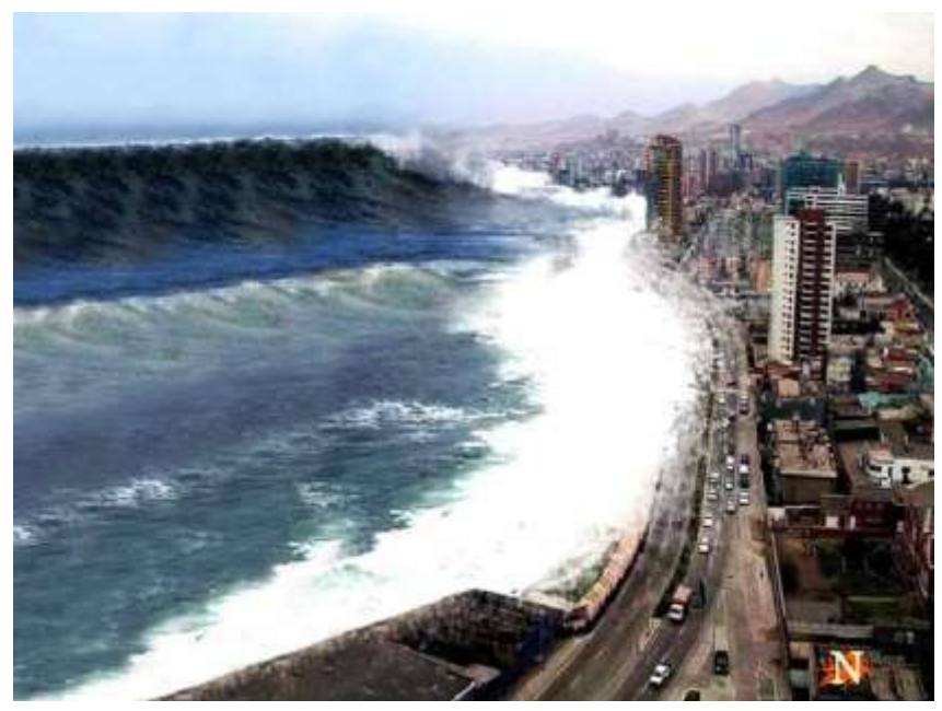
Fig. 1. Tsunami

In translation from Japanese of "tsunami" "the wave in the harbor" means, that is tsunami are big and long waves which are formed thanks to impact on all thickness of water. The big storm wave also differs from a tsunami in it. Influence of a big storm wave happens only on a reservoir surface, and at a tsunami all thickness of water is affected. At a tsunami not one wave, and is most often formed a little which are thrown out on the land with a temporary interval of 2 minutes till 2 o'clock (fig. 2).