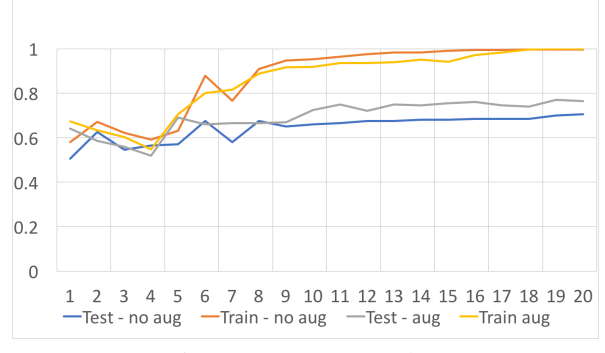
Figure XI: Accuracy plots

The accuracy plot at each epoch shows that neural augmentation helps a little in preventing overfitting. For most of the first 20 epochs of training, the training accuracy with augmentation is slightly lower than the training accuracy without augmentation. This implies that learning augmentation helps with generalizing the classifier. A comparison of the losses would be more apt but not viable in this case since the various experiments use different loss functions.