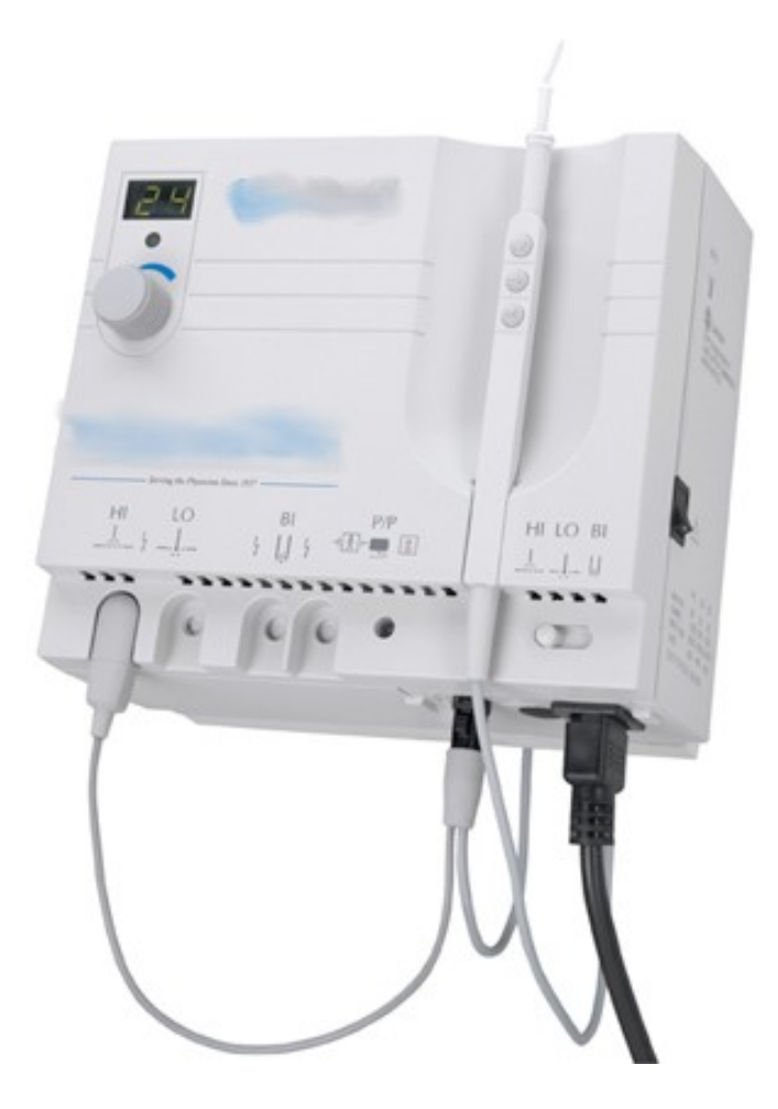
<u>Figure 2.</u> Typical hyfrecator-like device. The electrical charge must simultaneously produce the Lighthouse Frequency (or harmonic) and a precise current & voltage that will place the target object into a probable universe. The Lighthouse Frequency combined with a large electrical charge shifts the object into the target probable universe. The current and voltage must be precisely maintained to "hold" the glass ball in the other universe. A hyfrecator unit has the ability to adjust frequencies and deposit an electrical charge simultaneously. There are also industrial welding machines with high-frequency units, which could be modified for this type of application.