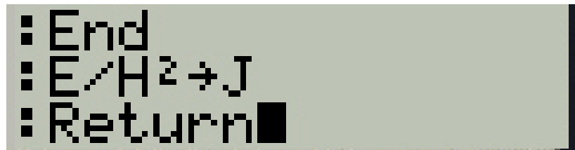
Figure 9: Caption for ssr-capture-2