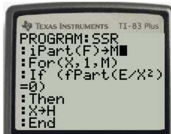
Figure 8: Caption for ssr-capture-1