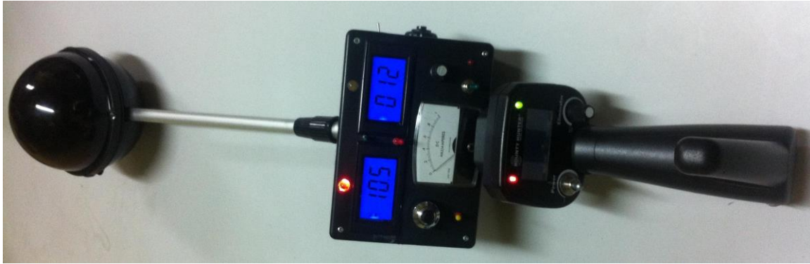
Fig.1. One of the versions of SEVA-instrument

SEVA measures components of the Field Gyroscope: its Quasi-Stationary Spinning, QSS, and Non-Stationary Spinning, NSS.