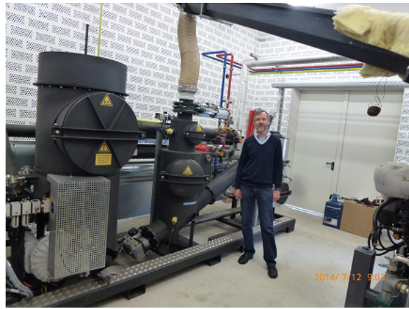
Fig. 4. Spanner Re 2 wood gas cogenerator installed by Josef Strobl Heizung Solar in Giglberg and Velden/Vils/Lower Bavaria/Germany. Left: suitable wood chips. Right: modern 100% wood to gas pyrolysis unit.