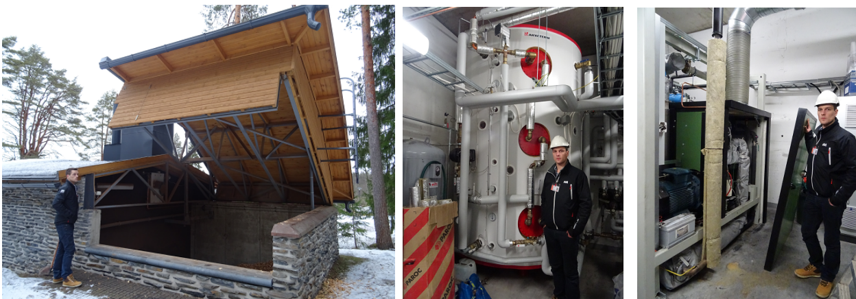
Fig. 8: Volter Oy wood gas cogenerator facilities near Kempele/Oulu/Finland. Left: hydraulic roof wood chip fuel storage. Center: warm water tank. Right: compact wood gas cogenerator. Supplying 32 residential units (see above layout drawing, blue) with total floor space of 2365 m 2 [Liikkujantie 19 2015].

The fuel supply can also be designed very practical and compact. One example is like a personal garage with a hydraulic roof (Fig. 8 left), that can be opened remotely, a wood chip truck moves in front of it, dumps its load of wood chips, and the roof is closed again remotely, thus providing supply for several weeks.