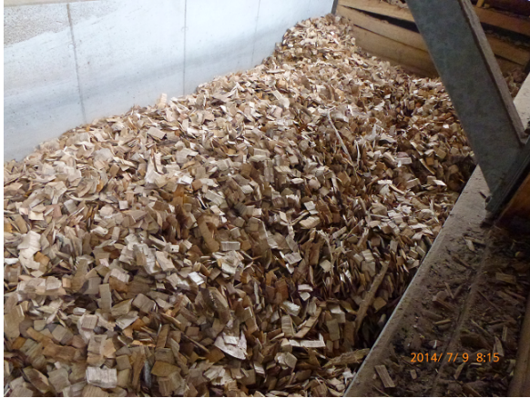
Fig. 1. Wood chips on Mainau Island.