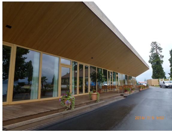
Fig. 3. Mainau Island Restaurants space heating/warm water by Wood Gas Cogeneration.

Next, we toured one of the first wood gas cogenerators set up by the Lower Bavarian (German: Niederbayern) Company Spanner Re 2 on a cooperative farm in Herdwangen, in the southern Black Forest region. The farmers faithfully and enthusiastically operated this machine for over seven years and continue to experiment with inserting a variety of forest residues, even including loads of pine needles. The Spanner Re 2 type of wood gas cogenerator is technically advanced, so that pyrolysis under the right automatically controlled thermal and chemical conditions completely turns any tar into useful wood gas. The only residue is a few percentage points of pure high quality carbon ash, used as fertilizer on organic fields. The wood gas cogenerator has an overall efficiency of 90% of turning the wood's chemical energy into electricity (approx. 1/3) and heat (approx. 2/3). [Heggelbach 2015] [Spanner Re 2015] [Ecolifelab 2014]