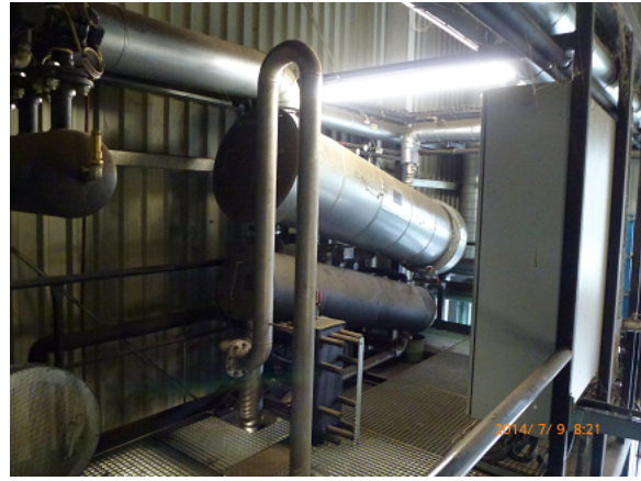
Fig. 2 and part of Urbas wood gas cogenerator on German tourist island of Mainau in the Lake of Constance, Summer 2014.