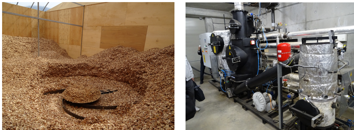
Fig. 7. Wood gas co-generator of Spanner K.K. installed 2014 in Ecomura near Koriyama, Fukushima Prefecture, Japan. Left: automatic feed-in of wood chips. Right: Spanner Re 2 pyrolysis unit (wood to gas).

Spanner Re 2 has set up in 2014 a branch company in Tokyo, Japan, named Spanner K.K. [Spanner K.K. 2014] Spanner K.K. imported in 2014 the first Spanner Re 2 manufactured wood gas cogenerator (Fig. 7 right) to Ecomura in the mountains near Koriyama, Fukushima, where it has cogenerated electricity and heat since October 2014. It soon became the frequent target of curious visitors, who want to learn about this new commercial technology, operating for the first time in Japan. The fuel is locally produced wood chips. We were able to visit this machine and see it in operation in March 2015. This experience taught us how important it is to secure wood chips of sufficient dryness (less than 13% fuel moisture, Fig. 7 left) for the effortless smooth operation of a wood gas cogenerator. (Excess moisture in the wood chip fuel means some of the cogeneration heat will be used for completely drying the fuel. [Spanner Re 3-fach 2015][Volter Oy 2015])