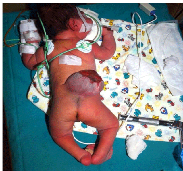
Figure 2: Equine right varus foot.

presented, which was then consulted with obstetricians who underwent dietary restrictions. Another important element in this case was the irregularity of the administration of vitamin supplements to the patient.