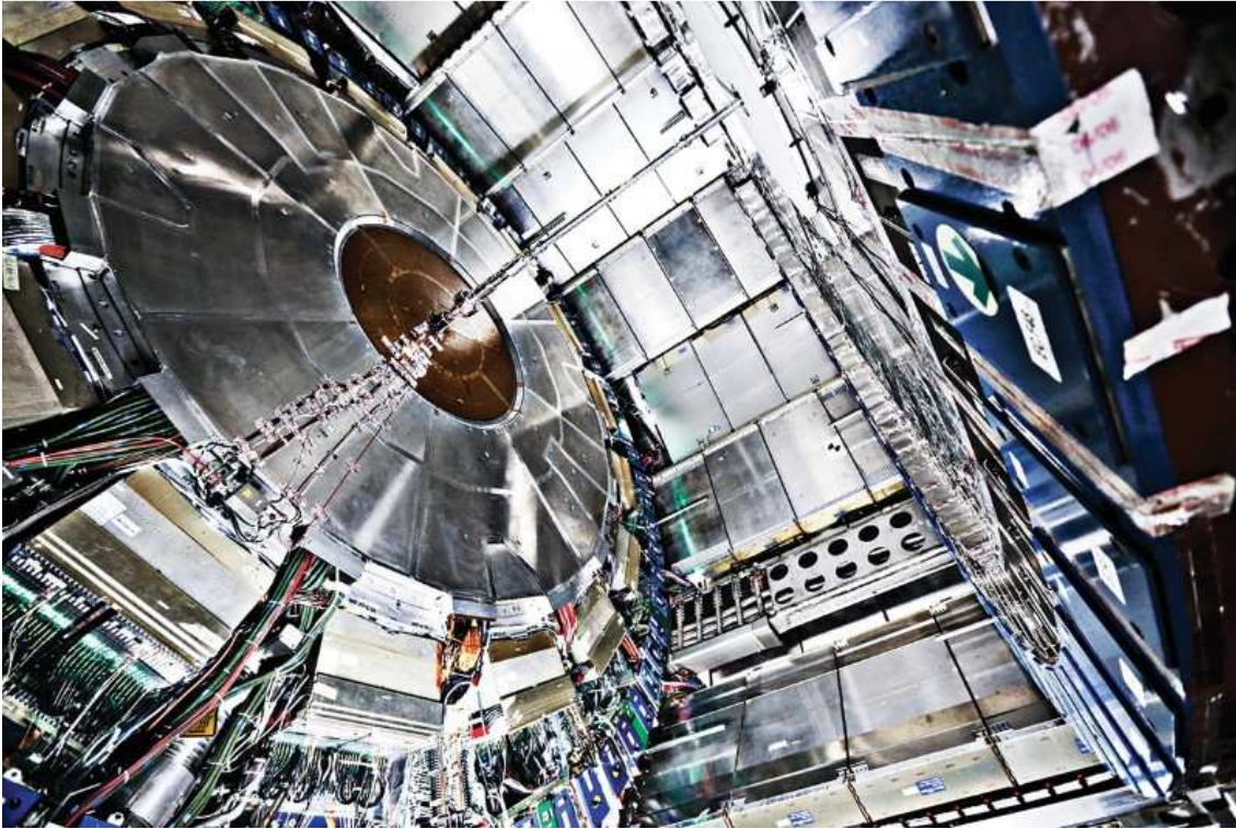
Mirroring the universe

Like your hands, some fundamental particles are different from their mirror images, and so have an intrinsic handedness or “chirality”. But some particles only seem to come in one of the two handedness options, leading to what’s called “left-right symmetry breaking”.