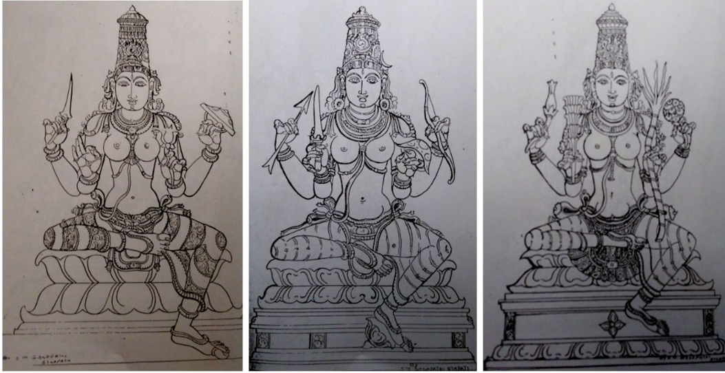
Prakata, Gupta and Guptatara Yoginis