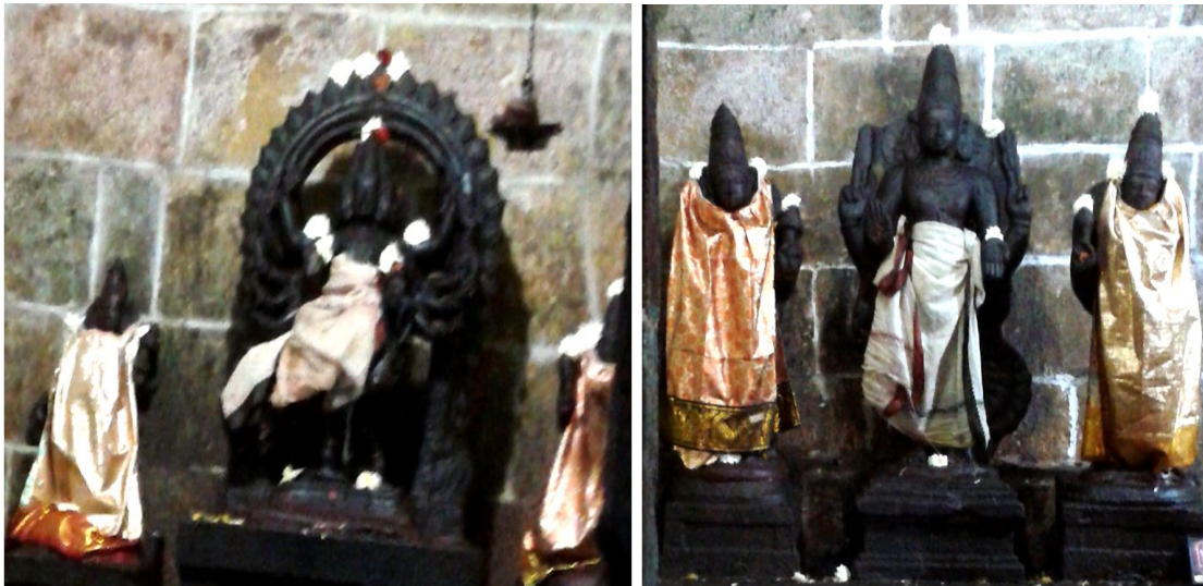
Dandanaatha Peethas: Shanmukha and Subrahmanya