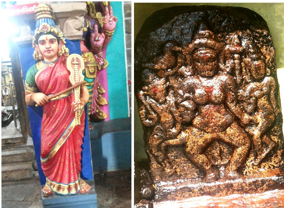
Kamalini and Jyeshta Devi

In Vamachara, Iccha Shakti is enshrined as Jyeshta Devi, also known as Kamalini or Alakshmi. Mythologically, She is the elder sister of Lakshmi and is the Goddess of Misfortune. Also known as Goddess Dhoomavathi, Jyeshta is determined to reorient passion channelized in the wrong, worldly direction, by throwing failures, misfortunes, losses and disappointments continuously at a person, until he realizes the futility of his efforts and attachments towards worldly delusions.