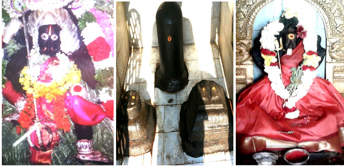
Chandi Pidaari, Sri Paaduka, Kaali Maariyamman

Whenever one talks about Shiva and Shakti as pure existence and its attributes, one must also talk about the realm in which these manifest - this is the realm of Saguna or existence with form, as opposed to Nirguna or formlessness. This Saguna is non-different from Maaya, since it is the illusive Maaya that creates a sense of individuality, existence, form, attributes and so on. Controller of Maaya and hence the realm of Saguna is Lord Maayon, which is an ancient Tamil name for Lord Vishnu or Narayana. Armed with the Shankha-Chakra or Conch-Discus representing Space and Time, the Lord Narayana is seen in Dakshinachara approach as the shrine of Jalashayina MahaVishnu situated directly behind Kamalaamba. From the presence of Srivatsa or Symbol of Prosperity seen on Jalashayina's right chest, as well as presence of Shankhanidhi and Padmanidhi, two of Lord Kubera's nine treasurers as the gatekeepers or dwarapalakas common to both Kamalaamba and Jalashayina, one understands that Jalashayina MahaVishnu is none other than the well known Lord Venkatesha of Tirupati.