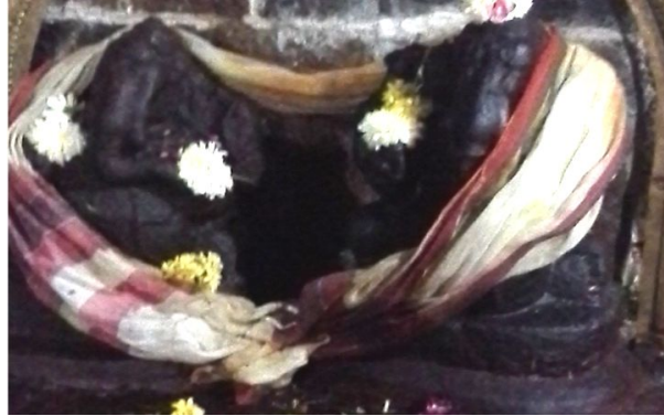
Rettai Ganapathi - Vighneshwara and Ganeshwara