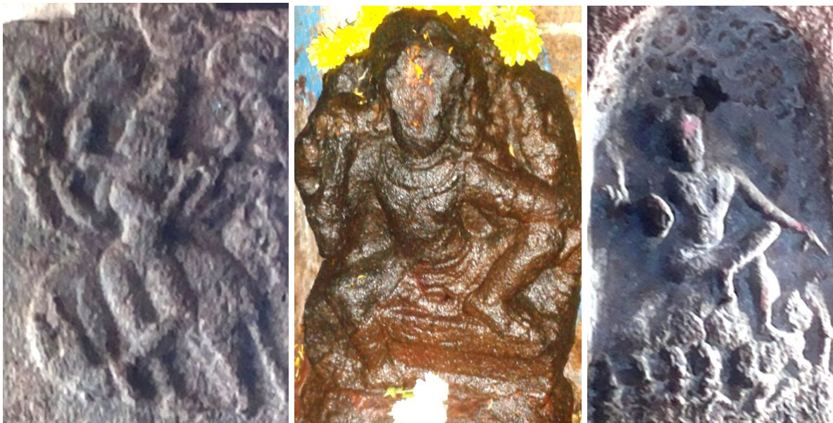
Guru: Krishna, Shaasta and Dakshinamurthi

For Vamachara, one sees as the Guru, Lord Krishna, who gave the world the supreme Bhagavad Gita, and who is seen as non-different from Kaali and the Universal Mother, in Brahma Vaivarta Puraana, Tantra Raja Tantra, and traditions such as Gopaalasundari. As stated by the Lord Himself in the Gita, He is the Atman itself, and is thus the Jagadguru. However, Krishna as completely identical with Shakti or Kaali is a conducive choice of Guru for Kaula and Vamacharas, and as a human incarnation who graced the earth along with fellow humans, Krishna is the ultimate Guru portraying the entire journey from human existence and Samsaara till Moksha. Through His Leelas or Divine plays and His teachings, Krishna reveals how one may transcend the delusions of Maaya and journey inwards, and thus, for Vamachara which is aimed at channelizing the one mired in Samsaara, Krishna as Guru is the ideal choice.