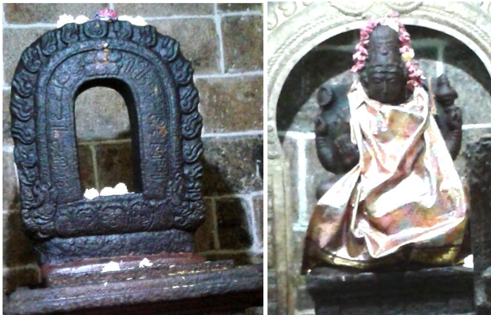
Mantrini Peethas: Akshara Peetha and Jnaana Saraswathi