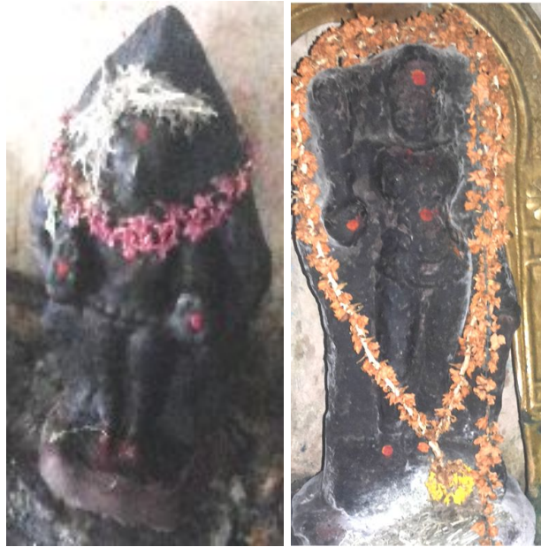
Vatuka Bhairava, Veerabhadra