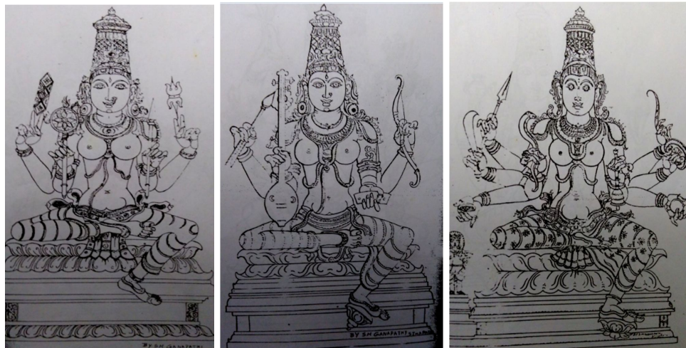
Nigarbha, Rahasya and Ati Rahasya Yoginis