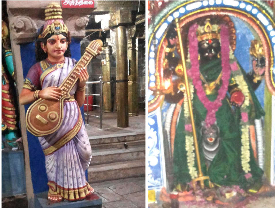
Anindika and Vaakdevi Pechi

In Vamachara, Jnaana Shakti is seen in a very fierce form called Pechi Amman or Vaakdevi. This Goddess presides over speech and represents the powerful and terrible aspects of words spoken when deluded by ignorance, as Thirukkural says “Aaraadhe Naavinaal Sutta Vadu”. Thus, for a person deluded by Maaya, Pechi represents the harmful effects of wrong words uttered and its repercussions, sometimes resulting in devastating consequences. This provides a jolt to the person to assess and understand his ignorance and turn focus away from Maaya.