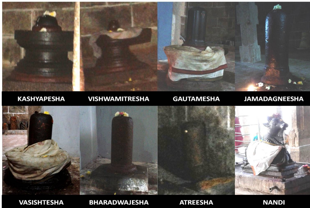
Sapa Rishi Shiva Lingas

As the perfect complement to Shiva is Shakti, who represents attributes such as name and form. Though the Shakti form of the temple complex is Neelotpalaamba, Dakshinachara sees Kamalaamba herself as both Shiva and Shakti, theoretically, there should no separate Shakti shrine. However, as presiding deities of the eight Yogini Devatas, we find the Shiddha Shakti or pure Shakti equivalents of the top two deities. Lalitha Ambika Herself is present in Shuddha