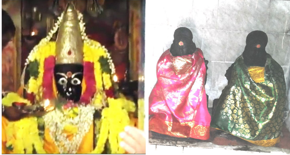
Renuka Devi; Renuka and Maatangi

with a shrine of Renuka and Maatangi, the two Goddesses with heads that were interchanged upon joining.