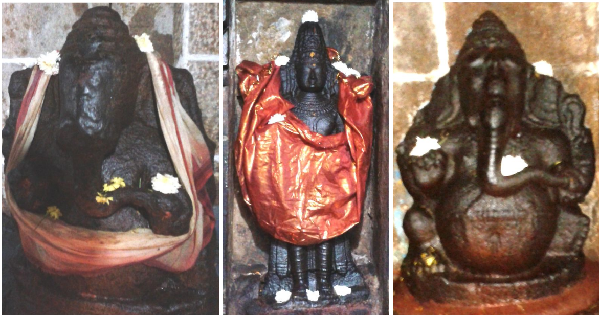
Uttara Vinaayaka, Brahma, Dakshina Vinaayaka

the northward and southward motions of the sun - Uttaramnaya and Dakshinamnaya, one sees the shrines of Uttara Vinaayaka and Dakshina Vinaayaka.