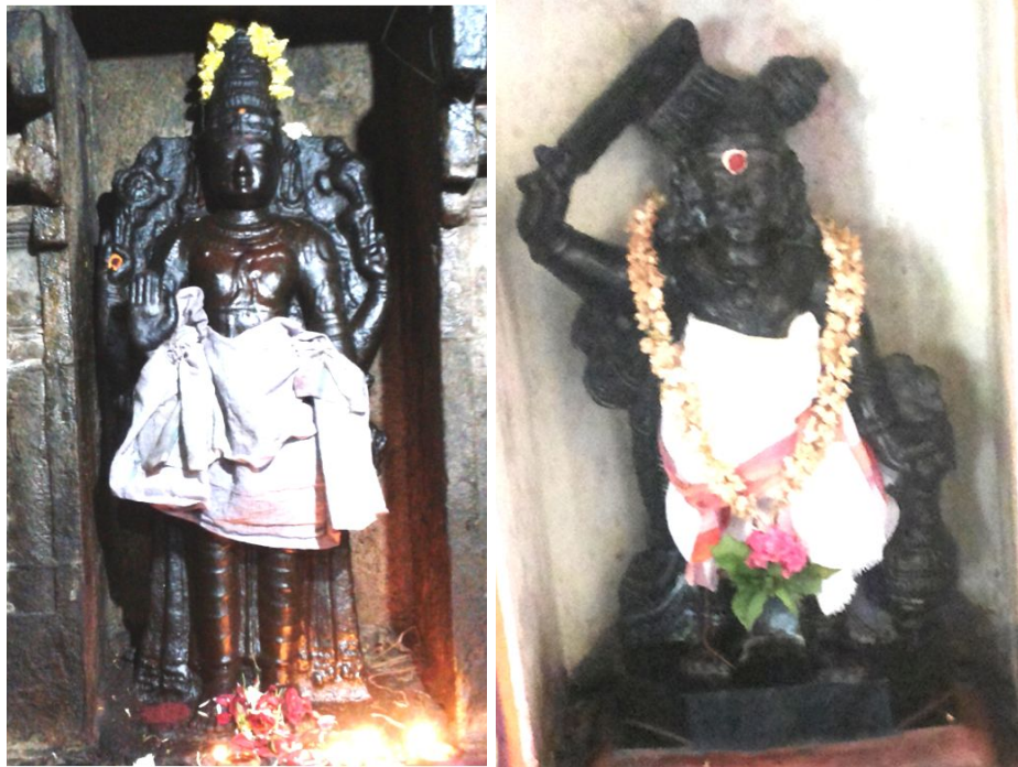
Jalashayina MahaVishnu, Karuppasami

While Jalashayina MahaVishnu as Baalaa represents the pleasant aspect of Maaya, turning worldly love of the aspirant into pure and sattvic Bhakti and devotion, Karuppasami represents the terrible aspects of Maaa, its delusion, and the harsh awakening to reality by destroying the deluded ones with his sword, which represents Jnaana or wisdom.