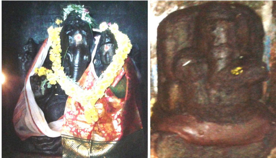
Ucchishta Ganapathi; Siddhi Vinaayaka

Among these, Dandanaatha is enshrined in two Peethas or shrines, which also form the shrines of Subrahmanya and Shanmukha discussed earlier. Mantrini is enshrined in two Peethas, on either side of the Vaaraahi Peethas. In the first, there is the Akshara Peetha which houses the 51 Aksharas or alphabets of Sanskrit, representing and bringing together the powers of 51 Shakti Peetha temples spread across the subcontinent. The second is the Mantra Peetha, on which is enshrined the deity of Jnaana Saraswathi, representing the power of Mantras or chants. Since both represent different forms of the alphabet, which itself has arisen from the primordial Pranava, these are to be seen as Vinaayaka shrines.