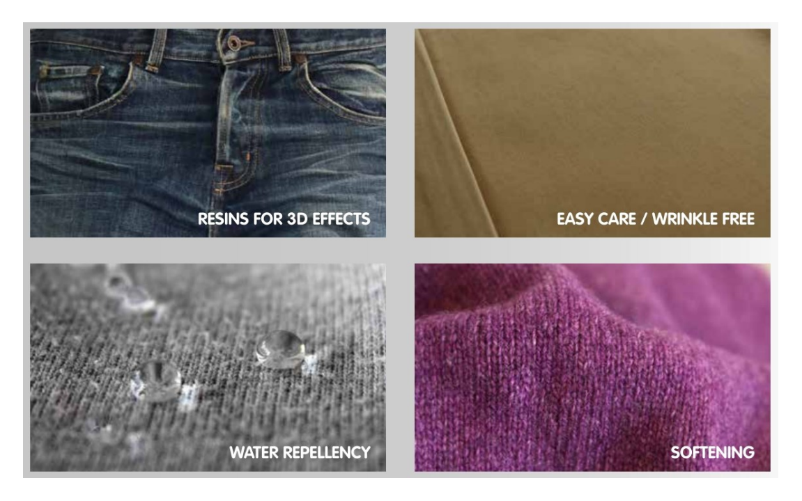
Figure 2: Some examples of the use of nano bubble technology.

The use of the e-flow technology derives a significant reduction of use of resources: water use reduction up to 98%, energy use reduction up to 47% and eliminating chemical wastes associated to water dumping, all of them involved in garment finishing processes.