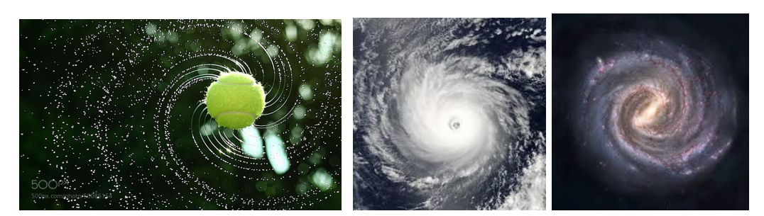
Tennis Ball with water flying off

In summation, we must study the small things to understand the big things. When we see a pattern in both something small and something large, it is almost always caused by the same OR similar forces. The force of gravity is not some form of unknown energy that reaches out from everything, touches something, and then by striking it, it causes the object to be pulled back to the original source. Instead, the force of gravity, inertia, and centripetal force are the result of the movement through matter of the second most common substance in our universe!