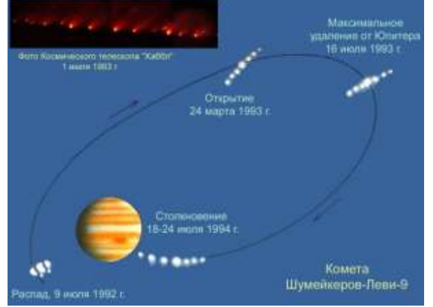
Fig. 2. Orientation of splinters of a comet Shumeykerov - Levi – 9