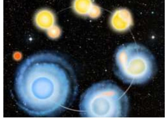
Fig. 3. Polarization of a congestion of galaxies