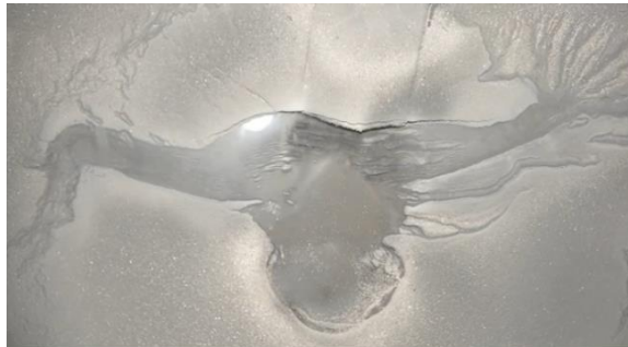
Figure 2. Laboratory Recreation of Possible Planetary Electrical Scarring [4]