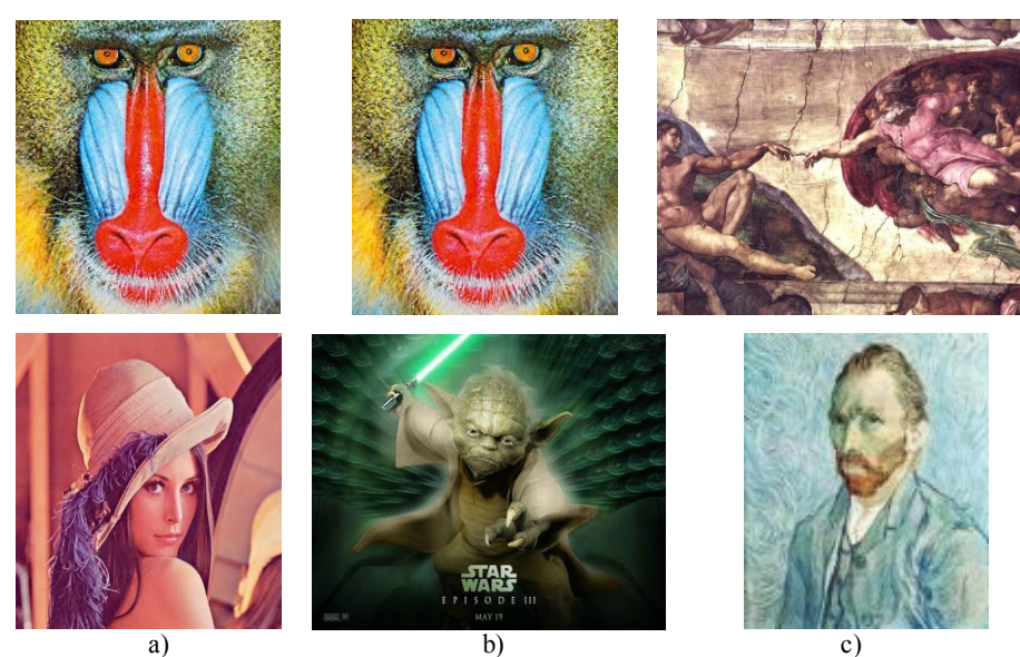
Fig. 2. Visual results for different tests by using our proposed method, the host and hide images are displayed from top to bottom a) column of test A, b) column of test B, and c) column of test C.