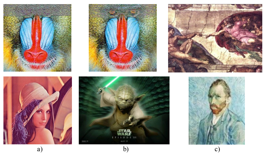
Fig. 3. Visual results for different tests by using a comparative method, the host and hide images are displayed from top to bottom a) column of test D, b) column of test E, and c) column of test F.