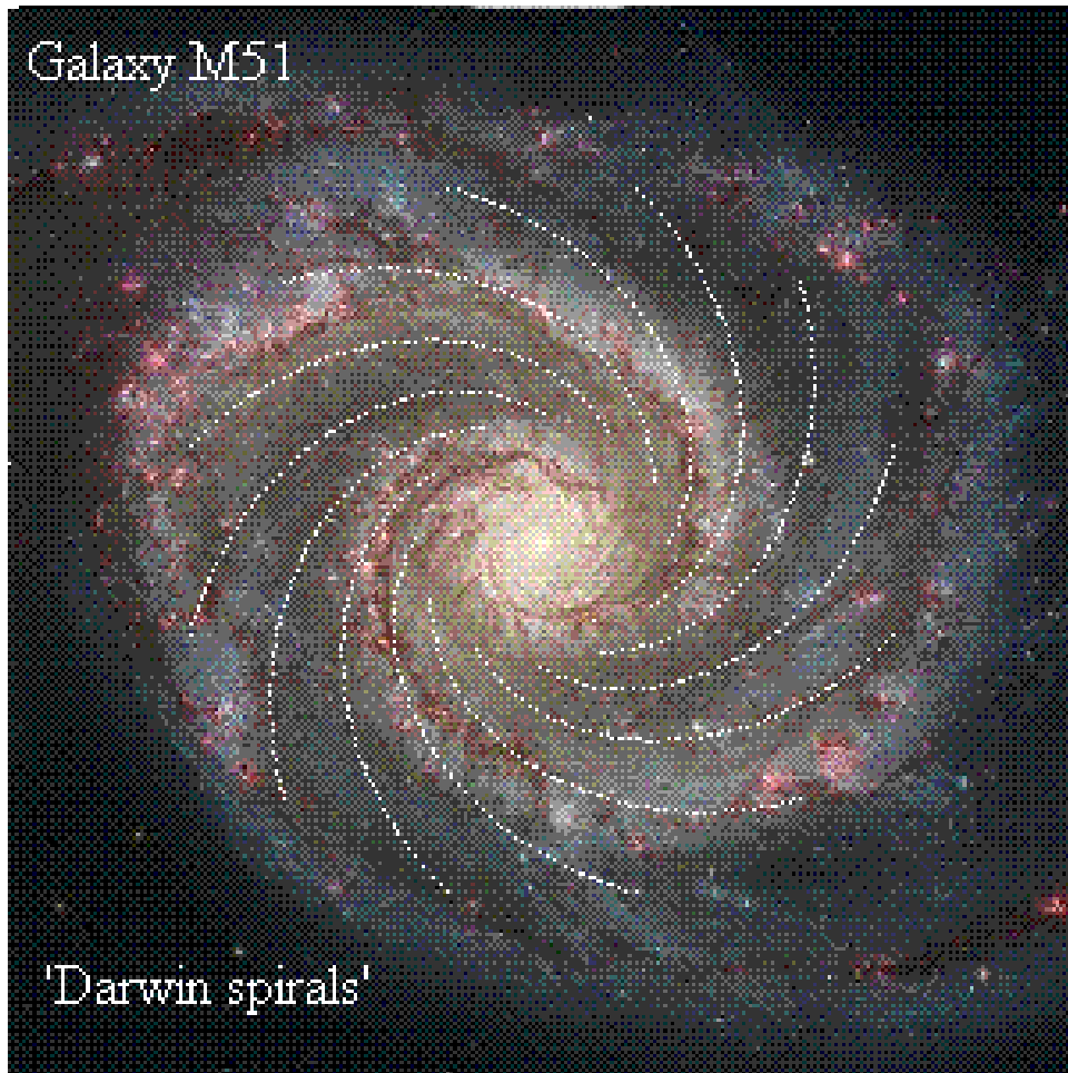
Figure 2: The shorter-wavelength image of normal spiral galaxy M51. The arms follow equiangular spirals (golden spirals) which are the Darwin curves of exponential disk.

center intersects the spiral and makes a constant angle with the spiral curve at every point. How is a golden spiral related to the exponential disk?