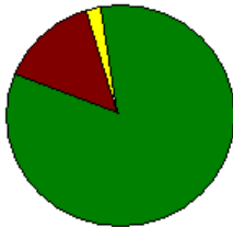
Gravity Centered Cosmology using Fusion/Star Model