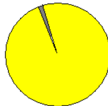
Plasma Centered Model