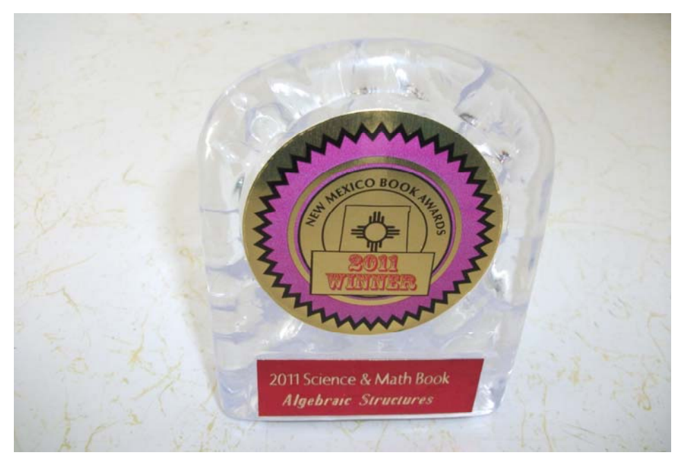
Trophy of the 2011 New Mexico Book Award at the category Science & Math for Algebraic Structures

After a first selection the finalists were notified in the month of September, while banquet and the winner has taken place in the MCM Elegante Hotel from Albuquerque on 18 November, assisted by about 160 persons.