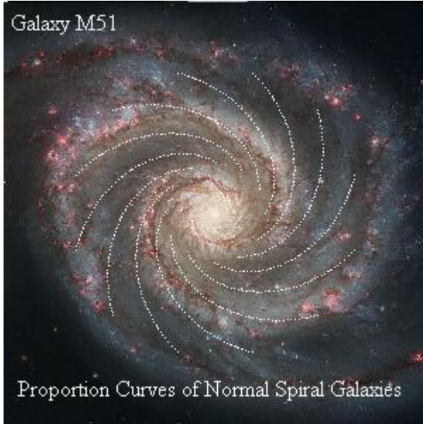
Figure 1: The shorter-wavelength image of normal spiral galaxy M51. The arms follow equiangular spirals which are the proportion curves of exponential disk.

Now that the origin of arms for normal spiral galaxies is explained, I go further to study barred spiral galaxies (see papers [5]). Are barred spiral galaxies rational? If they are, what do the corresponding proportion curves look like? In Section 2, I answer the first question. Section 3 is dedicated to the explanation of the second question. Section 4 is the conclusion.