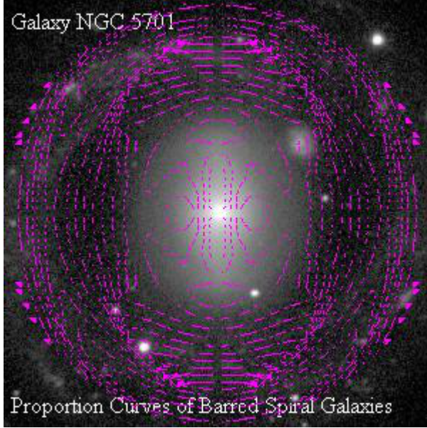
Figure 4: The image of barred spiral galaxy NGC 5701 as shown on Figure 2. The spider-shaped proportion curves do trace or cut through arms consistently as in the case of normal spiral galaxies (see Figure 1).

spiral galaxies could be expressed with simple functions too. The calculation of the azimuthal angle \alpha for the tangential lines of proportion curves involves the third derivatives of f(x, y) while the calculation of the rational orthogonal conditions involves the fourth derivatives. Without further theoretical analysis and appropriate computing technique, the direct numerical calculation with common computers may present significant errors. Fortunately, the error can be greatly reduced by the choice of larger scale s in the formula (7). The choice of the scale in Table 1 (the third column) indicates that the left sides of the orthogonal conditions (13) and (15) (i.e., P(x, y) and G(x, y) ) are significantly small in the relevant areas for the galaxy NGC 5701. That is, the absolute values of these quantities are generally less than 10^{-16} . This suggests that the galaxy is rational. Detailed calculation indicates that there are a few lined areas where the discriminant of the quadratic equation (11) is negative. This means that the galaxy must be at the ground state in the relevant areas. In all other areas, the absolute values of P(x, y) are much smaller than the ones of the quantities M(x, y) and G(x, y) . It means that the galaxy is generally at the excited plus state.