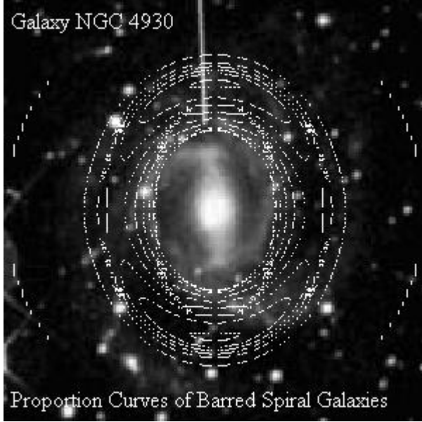
Figure 4: The image of barred spiral galaxy NGC 4930 as shown on Figure 2. The spider-shaped proportion curves do trace or cut through arms consistently as in the case of normal spiral galaxies (see Figure 1).

spiral galaxies could be expressed with simple functions too. The calculation of the azimuthal angle \alpha for the tangential lines of proportion curves involves the third derivatives of f(x, y) while the calculation of the rational orthogonal conditions involves the fourth derivatives. Without further theoretical analysis and appropriate computing technique, the direct numerical calculation with common computers may present significant errors. Fortunately, the error can be greatly reduced by the choice of larger scale s in the formula (7). The choice of the scale in Table 1 (the third column) indicates that the left sides of the orthogonal conditions (13) and (15) (i.e., P(x, y) and G(x, y) ) are significantly small in the relevant areas for the galaxy NGC 4930. That is, the absolute values of these quantities are generally less than 10^{-16} . This suggests that the galaxy is rational. Detailed calculation indicates that there are a few lined areas where the discriminant of the quadratic equation (11) is negative. This means that the galaxy must be at the ground state in the relevant areas. In all other areas, the absolute values of P(x, y) are much smaller than the ones of the quantities M(x, y) and G(x, y) . It means that the galaxy is generally at the excited plus state.